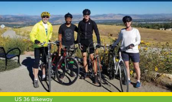
US 36 Bikeway