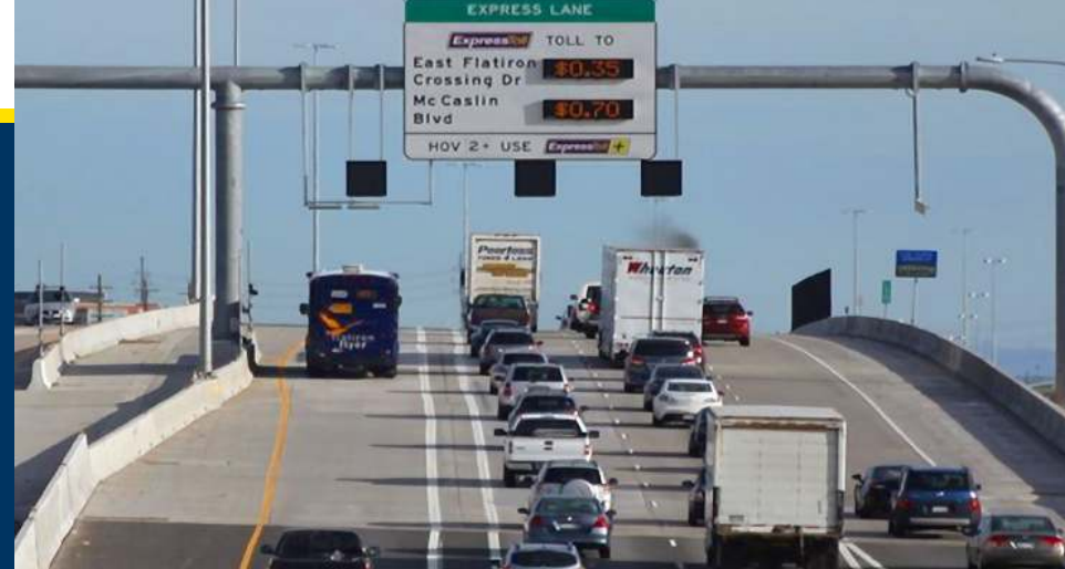
US 36 Express Lanes