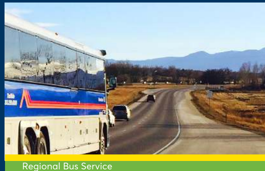
Regional Bus Service

For more information: commutingsolutions.org