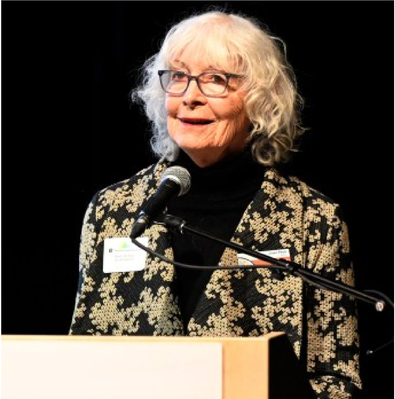
Longmont Mayor, Joan Peck, speaks during the eighth Sustainable Transportation Summit.