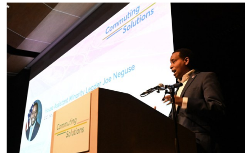
U.S. Rep. Joe Neguse (D-Lafayette), speaks during the eighth Sustainable Transportation Summit at the Longmont Museum.