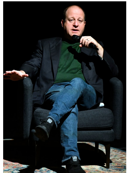
Gov. Jared Polis answers questions during the eighth Sustainable Transportation Summit at the Longmont Museum on Tuesday.

Polis also stressed the importance of putting affordable housing close to job centers, preventing the need for long commutes. He commended Longmont for recently abolishing minimum parking requirements for future developments.