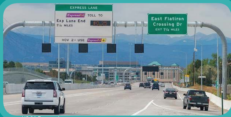
US 36 Express Lanes

For more information: commutingsolutions.org