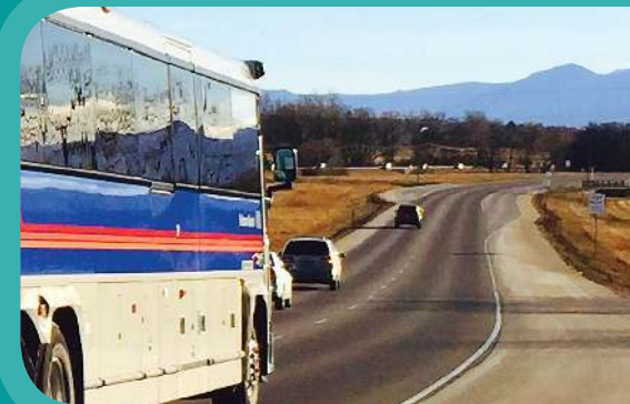
Regional Bus Service