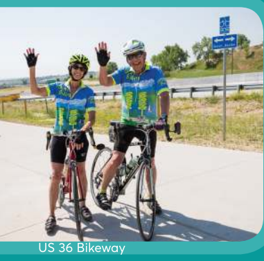
US 36 Bikeway

For more information: commutingsolutions.org