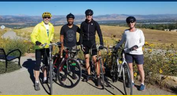
US 36 Bikeway