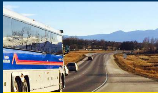
Regional Bus Service

For more information: commutingsolutions.org