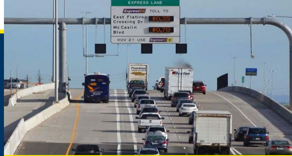
US 36 Express Lanes